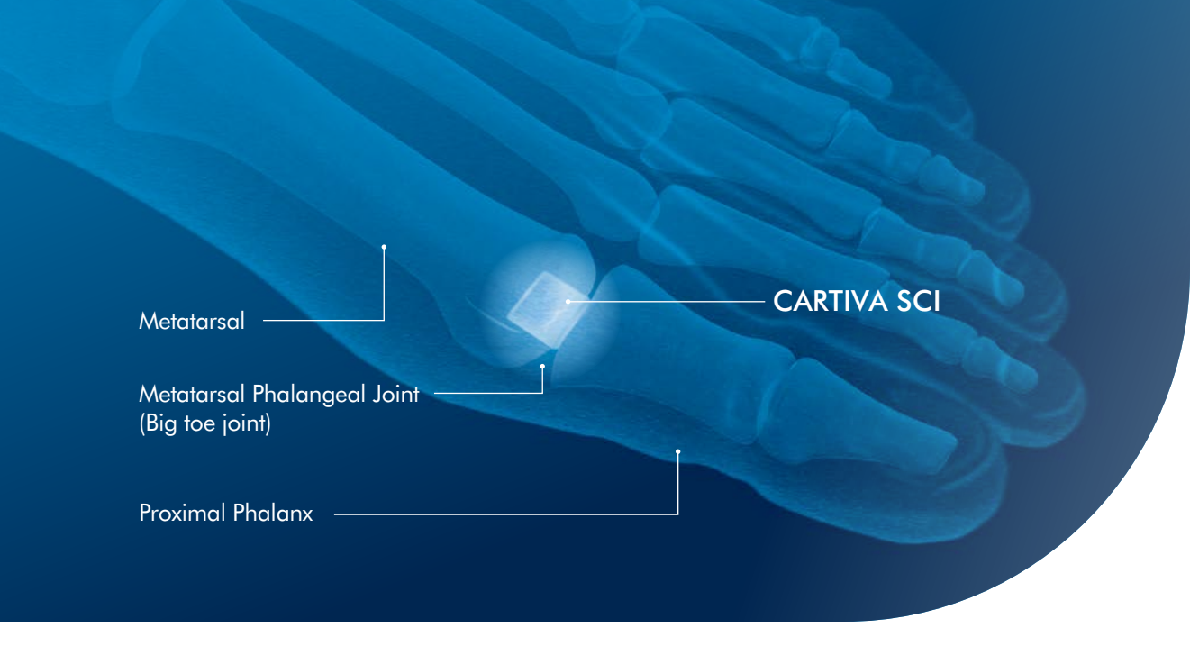
Figure 2: Metatarsophalangeal Joint (MTP joint) with the Cartiva SCI shown implanted